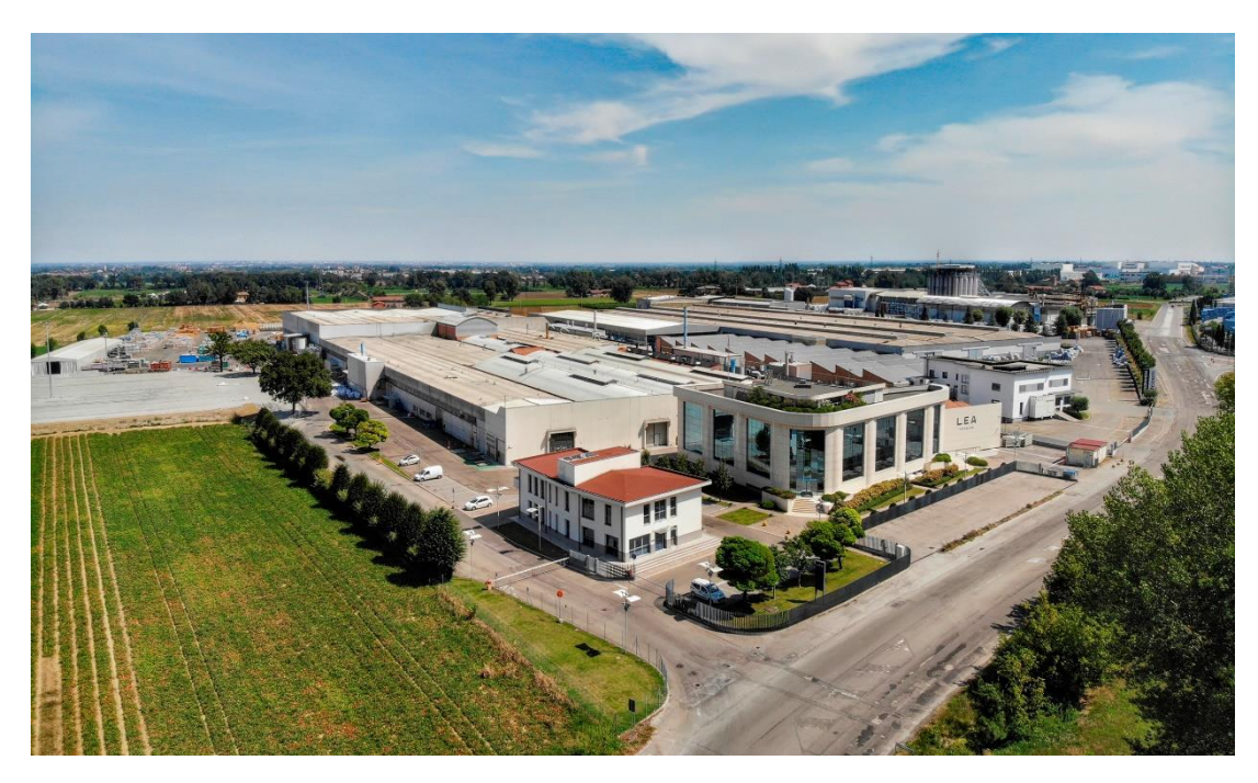
Fiorano Modenese Panariagroup Facilities